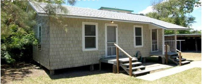
Separate Guest House