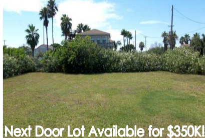
Next Door Lot Available for $350K!