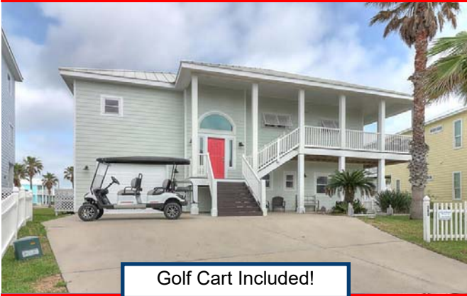
Golf Cart Included!