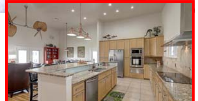
Massive Chef's Kitchen!

almost every room, a pool and hot tub across the street, golf-cart access (with cart included!) and rental income projections of $145 K/yr.! Split level entry leads upstairs to vaulted-ceiling massive great room. Custom chef's kitchen wows with oversized island, granite counters and stainless appliances including ice maker and wine fridge. Relax on the 3-sided wrap around deck with pond views. Master retreat features huge ensuite bath with dual head shower and double vanity, deck access and more water views. Powder room on this level. Ground level offers 3 more bdrms, 2 baths, laundry and oversized garage. So many extras: 2 masters, Bahama shutters, Trex decking, sprinkler system, outdoor shower, private water closets, metal roof, more! Prime location near pool and beach walkover + just a golf cart ride to dining and shopping. Fully furnished with 6-seater golf cart included!