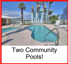
Two Community Pools!

Beach - Access Stunner! Gorgeous 4 BR, 3 1/2 bath house in coveted Royal Sands with golf cart included! This beauty has it ALL: beach access just steps away, posh neighborhood, fully furnished, pond views from