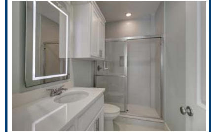
Detached Pool House