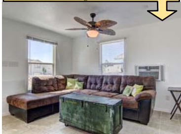
2/1 Guest House