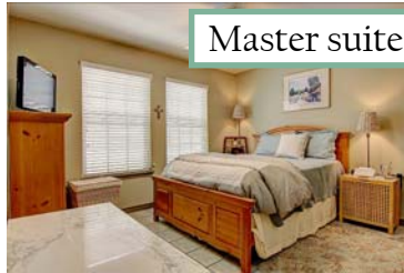
Master suite and master bath

4-PLEX 3 Bedroom—2 bath uses upper deck entrance. Tile throughout, hurricane shutters, washer/dryer hookup!