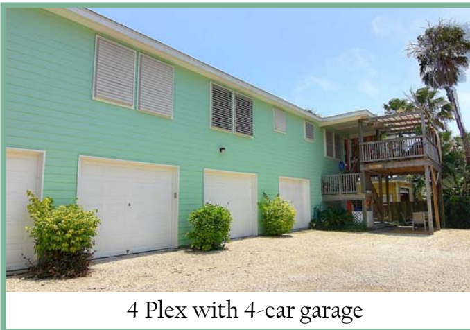
4 Plex with 4-car garage