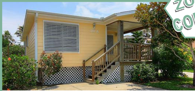
Two 2-bedroom Cottages

Rent this property long term or short term or operate as a business. The possibilities are endless!!! Tucked away in the heart of Port A, and convenient to restaurants, shops & shops & the beach!!!