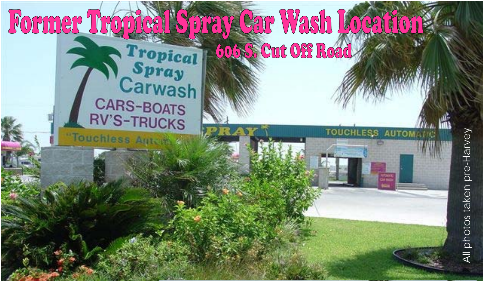
All photos taken pre-Harvey